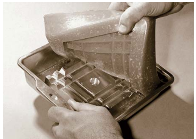
Cure the EZ-Cast™ mold and peel out your finished pliable mold.

Refer to Price List for complete order information.