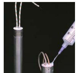
Ceramacast™ 586 pots ignitor and cartridge heater.