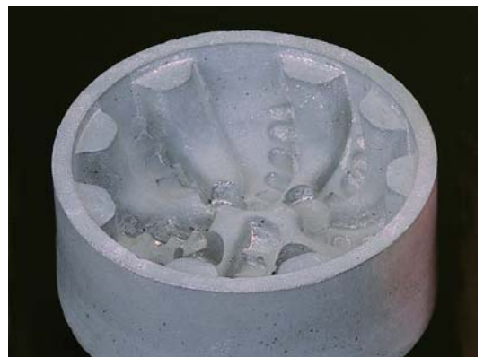
Ceramacast™ 673 mold for down-hole drill bit.