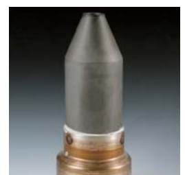
Ceramacast™ 673-N bonds SiC combustion nozzle.