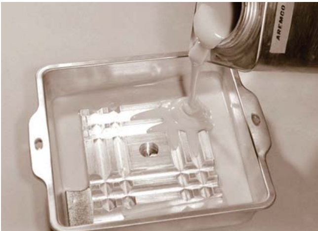
Place the machined master, a duplicate of the finished casting, into a pan, and pour the EZ-Cast™ over the master.