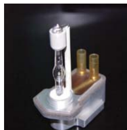
Ceramacast™ 575-N bonds Xenon arc lamp.