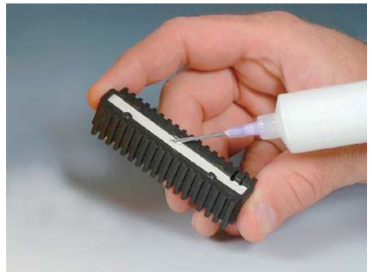
Ceramacast™ 586 pots high power resistor.

Brazing Fixtures, Crucibles, Encapsulating RF Coils, Furnace Carriers, Heating Element Holders, Induction Heating Tools, Molds for Powder Metallurgy, Rapid Prototype Molds, Sintering Boats, Standoffs, Welding Jigs